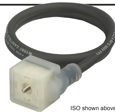
ISO shown above

The Canfield Series 5F all-molded DIN solenoid valve connector/gasket/cord assembly offers a completely molded design that is far better for environmental integrity than field wire versions. Made from rugged yet flexible polyurethane, the connector housing boasts high durability factors and application versatility. The low profile "straight-line" interface/cord configuration allows for installation in many limited space applications. The integrated gasket design boasts an IP67/NEMA 6 rating and makes it impossible to lose the gasket. The 5F and 5J are the only molded valve connectors in the industry that feature a HARD USAGE cord as a standard option in any length required, bi-directional indicator lights, and load suppression (not intended for UL 1449). UL and CSA versions are available as well. Canfield offers any version of the 5F connector with special wires including high flex, media compatible wire, special use wire, high temperature wire on request.